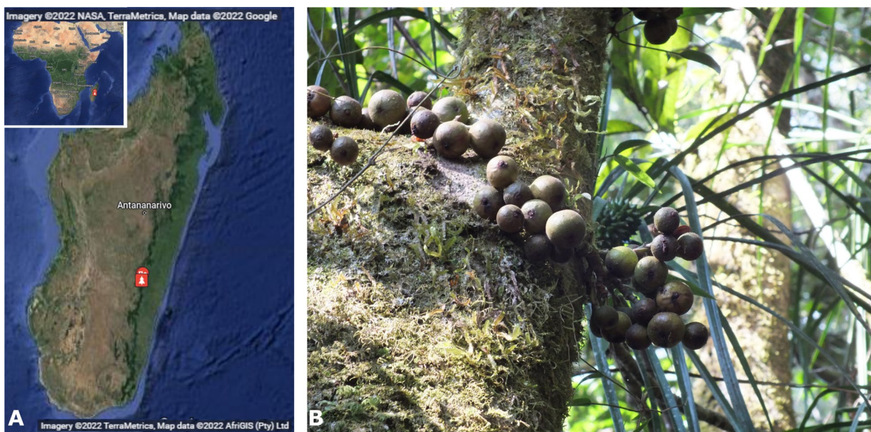
Fig. 1 Model system. A Location of Ranomafana National Park, east Madagascar. B Ficus tiliifolia in situ